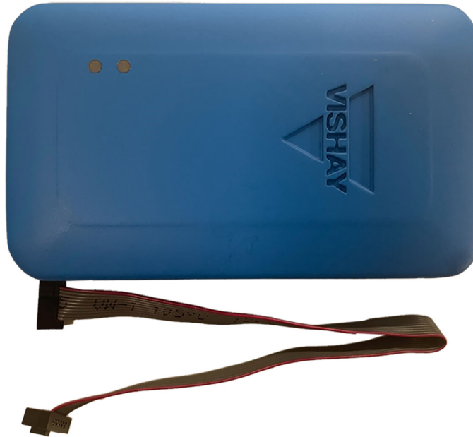
Fig. 1 - Dongle Front Side

The Vishay communication dongle is used as an interface between a computer and a PMBUS enabled device (potentially a device with other communication protocol in the future). The dongle board and cable are shown in Fig. 1 and Fig. 2.