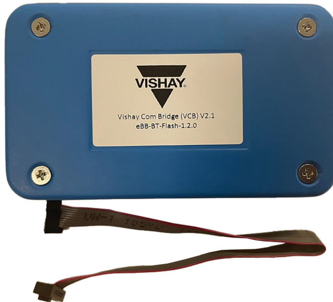
Fig. 2 - Dongle Back Side