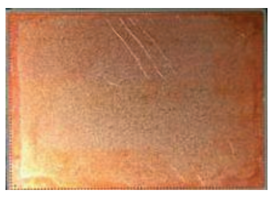
Fig. 4 - Example of Scratch

Slightly scratch also do not have impact on thermal dissipation and on device performances (Fig. 4 as example).