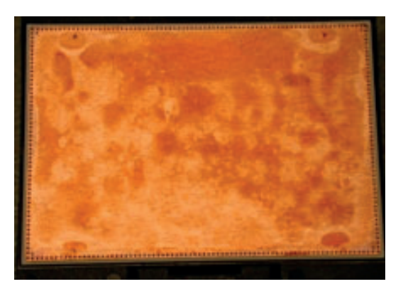
Fig. 3 - Example of Discoloration

Slightly scratch also do not have impact on thermal dissipation and on device performances (Fig. 4 as example).