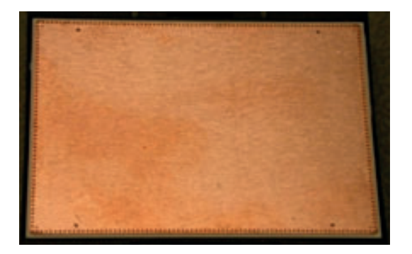
Fig. 1 - Example of Discoloration

The mounting surface of AAP module must be with no particles. Discolorations or polished copper layer can be present as results of overall assembly process of the device; they do not have impact on thermal dissipation and on device performances in final applications therefore are considered just as cosmetic imperfection (see below figures as examples).