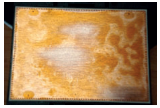
Fig. 2 - Example of Discoloration