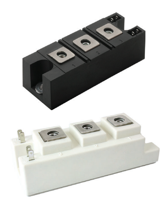
Fig. 1 - Examples of IAP Modules

Recommendations for each of these items and requirements for mounting IAP modules to the heatsink are discussed in the following sections.