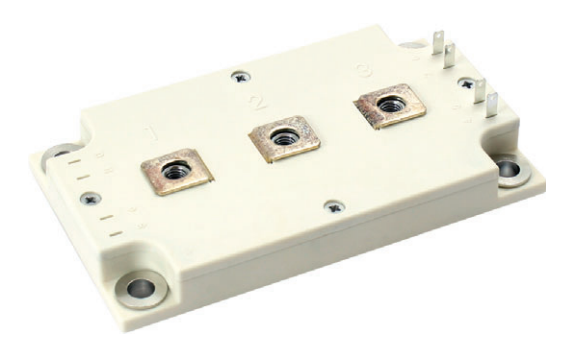
Fig. 1 - Example of a DIAP low-profile module

DIAP low-profile modules are designed to provide reliable performance in rugged 300 A to 400 A industrial applications. A single housing is used to integrate power components, providing higher power density. Various die selections are available in several configurations.