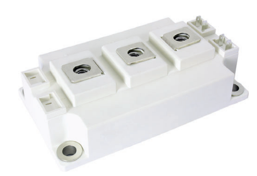
Fig. 1 - Example of a DIAP module

DIAP modules are designed to provide reliable performance. A single housing is used to integrate power components, providing higher power density. Various die selections are available in several configurations.