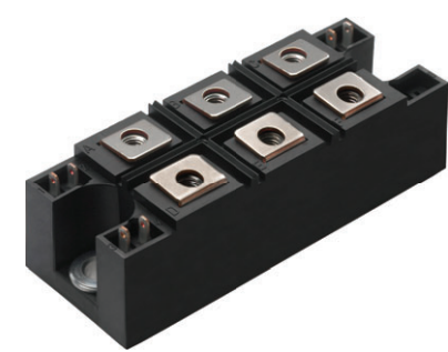
Fig. 1 - Example of the MTK

MTK modules are designed to provide reliable performance. A single housing is used to integrate power components, providing higher power density. Various die selections are available in several configurations.