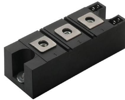
Fig. 1 - Example of a IAP Module

IAP modules are designed to provide reliable performance. A single housing is used to integrate power components, providing higher power density. Various die selections are available in several configurations.